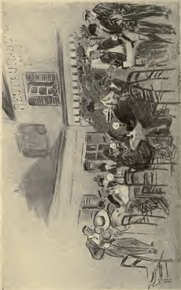
IF YOU HAVE NOT THE ENERGY TO FIND IT, YOU DON'T DESERVE TO KNOW THE RESTAURANT DU COUCOU.